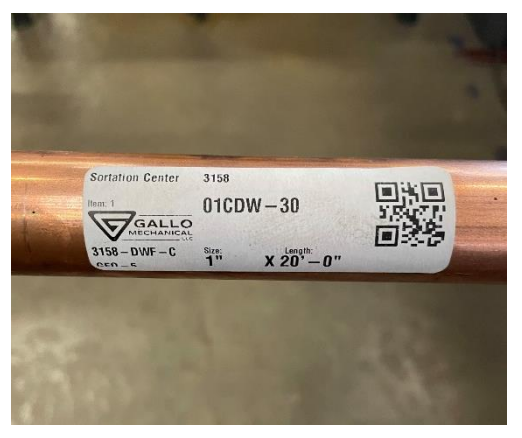
Automated label printed from MSUITE FAB for each TigerStop cut.

Gallo's shop-controlled environment enables them to maintain high quality and constant productivity levels regardless of project site conditions. MSUITE FAB automates real-time production and material logistics from the shop floor to take their fabrication capabilities to a new level.