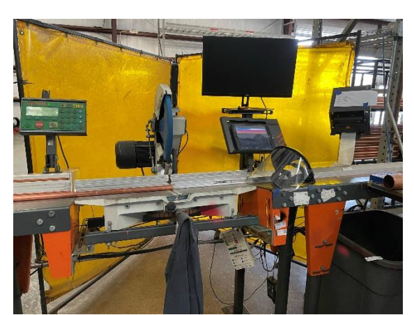
MSUITE FAB directly controls the TigerStop and wireless printer.

Gallo is at the forefront of using MEP manufacturing technology to gain strategic advantages. The MSUITE - TigerStop integration connects model data to shop floor cut stations to automate the cut list creation and optimization/nesting processes.