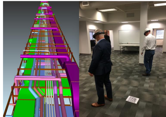
Microsoft HoloLens, Mixed Reality units, and BIM modeling helped visualize Targets for Prefabrication.

Mixed Reality was also used to QA/QC modules and allow the owner to "walk through" virtual racks along side the fabricated racks.